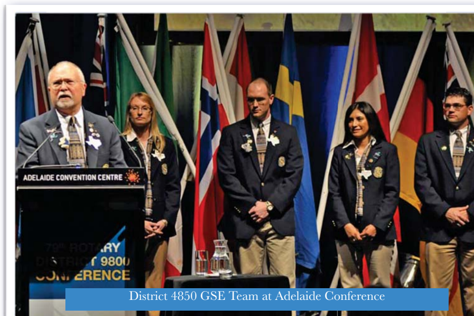
District 4850 GSE Team at Adelaide Conference

Districts, D3030 in Central India, centred around Nagpur and D5230 centred around Monterey in California USA. The outbound team to India will leave Australia on the 14th January 2012 and the outbound team to the USA will leave on the 22nd April 2012.